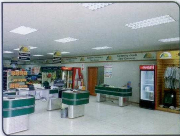
Eston's new showroom