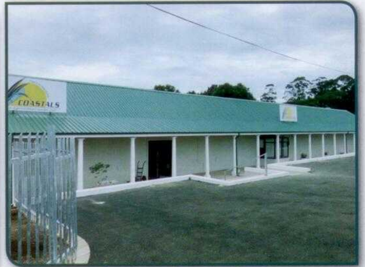
Revamped Waverley store