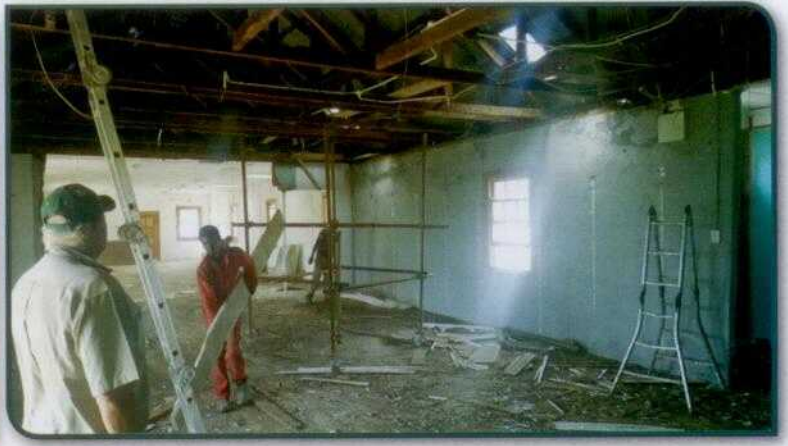
The old Waverley Store

The story of how the old Waverley Store premises in Eston transformed from an ugly duckling to the Cinderella of Coastals is an interesting one, with twists and turns along the way.