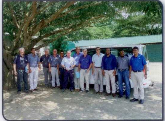
Coastals board and management team

The annual Coastals Board of Directors and management tour of the branches was undertaken on the 6 th and 7 th of March 2018, with the seven, "northern most" branches being visited this time around. The tour provides an excellent opportunity for the board to view the branches, meet the staff at the forefront of our operations and to strategize on future developments that would help improve our branch network.