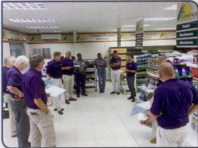
Briefing at the Ging branch